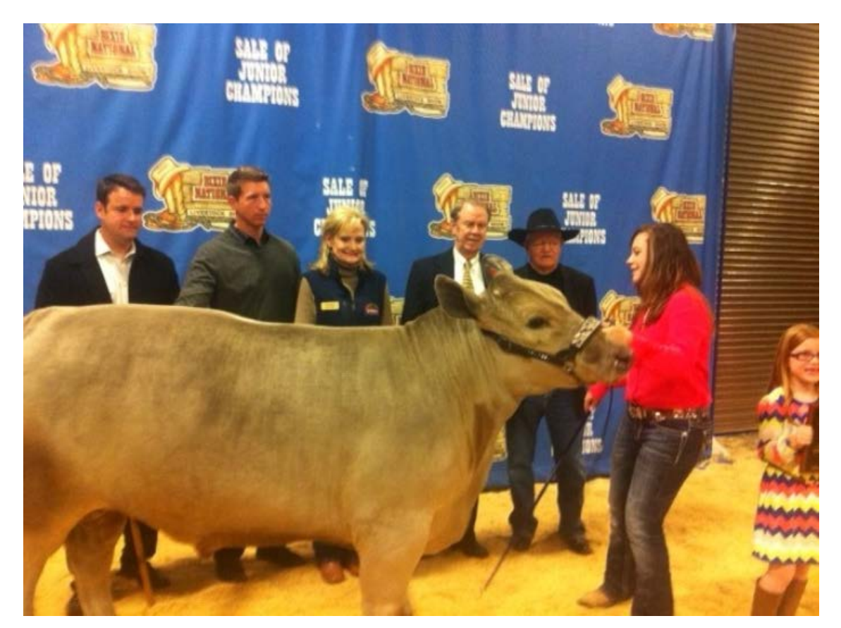
Commissioner Chaney and Commissioner of Agriculture Cindy Hyde-Smith reviewed livestock at the Dixie National Rodeo and Livestock show in Jackson, MS.

Internal Review — The review of the insurer's determination that a requested or provided health care service or treatment health care service is not or was not medically necessary by an individual(s) associated with the health plan. PPACA requires all plans to conduct an internal review upon request of the patient or the patient's representative.