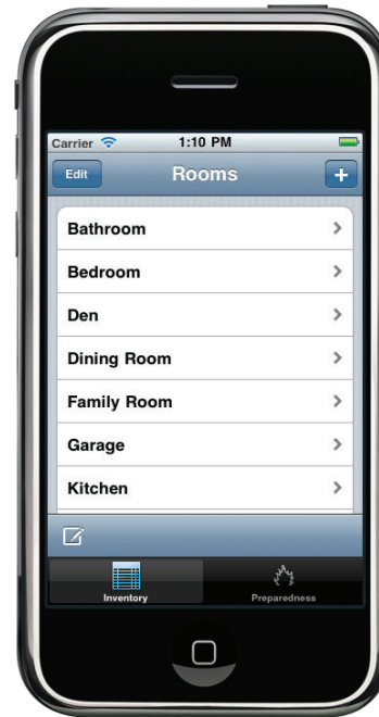
3. Select a room