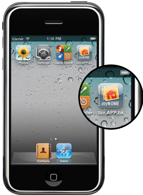
1. Launch App

A home inventory can be invaluable when deciding how much insurance coverage fits your life situation, and makes sure you are adequately protected should you need to file a claim. NOW THERE'S AN iPhone APP FOR THAT!